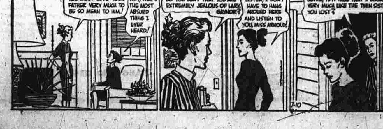
THE STORY OF MARTHA WAYNE